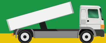
MINI DUMP TRUCK • 3,000 KG