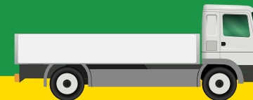
PICKUP TRUCK • 2,000 KG