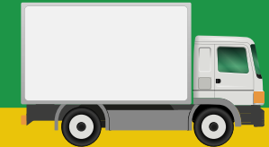
CLOSED VAN • 2,000 KG • 8 M 3