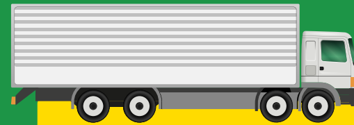
WING VAN • 28,000 KG • 68 M 3