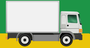
CLOSED VAN • 2,000 KG • 8 M 3