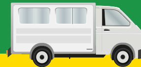
L300/VAN • 1,000 KG • 3 M 3