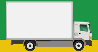
6W FWD TRUCK • 7,000 KG • 21 M 3