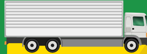
10W WING VAN • 15,000 KG • 55 M 3