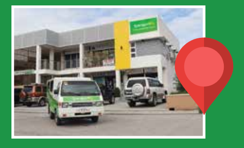
Pampanga Office MacArthur Highway San Fernando Pampanga