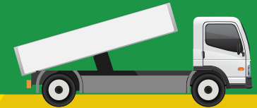
MINI DUMP TRUCK 3.5 tons