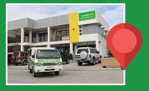
Pampanga Office MacArthur Highway San Fernando Pampanga