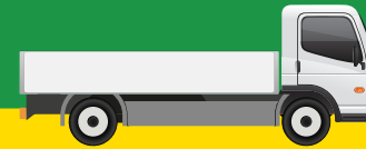
OPEN TRUCK 2 tons - 7 tons (10ft - 21ft)