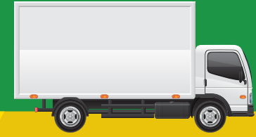
CLOSED VAN 4W/6W 2 tons - 7 tons (10ft - 18ft)