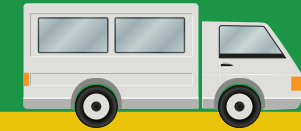
L300/VAN 1,000kg (8ft - 10ft)