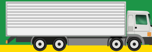
WING VAN 12 tons - 28 tons (32ft - 40ft)